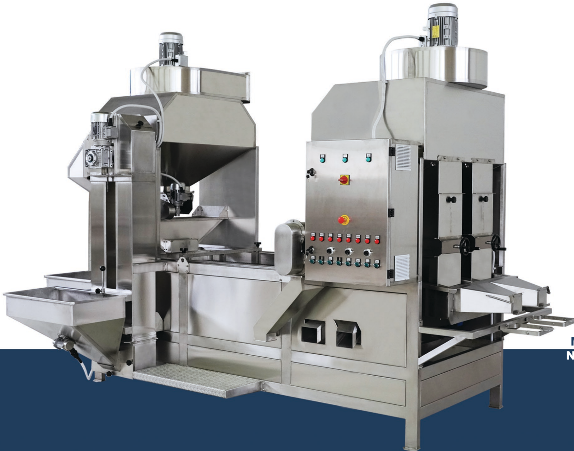
MODEL NOT 90S

NOT 90S is a dry nuts cleaning and sorting machine. It has all the technical specifications and standards of modern and innovative production unit. It has a rapid production times and complies with food hygiene and safety regulations.