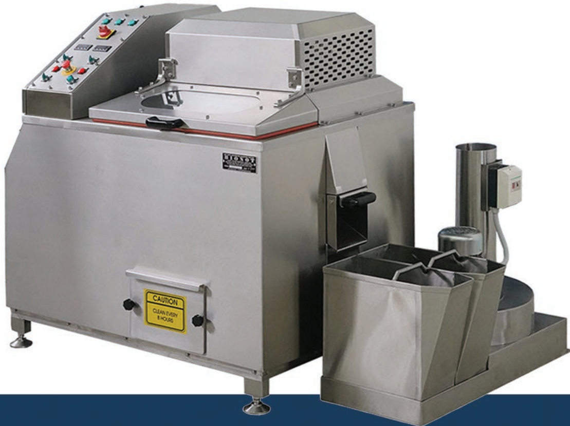
MODEL NHL 40

Ideal for roasting all kind of nuts, including sunflower seeds and pumpkin seeds.