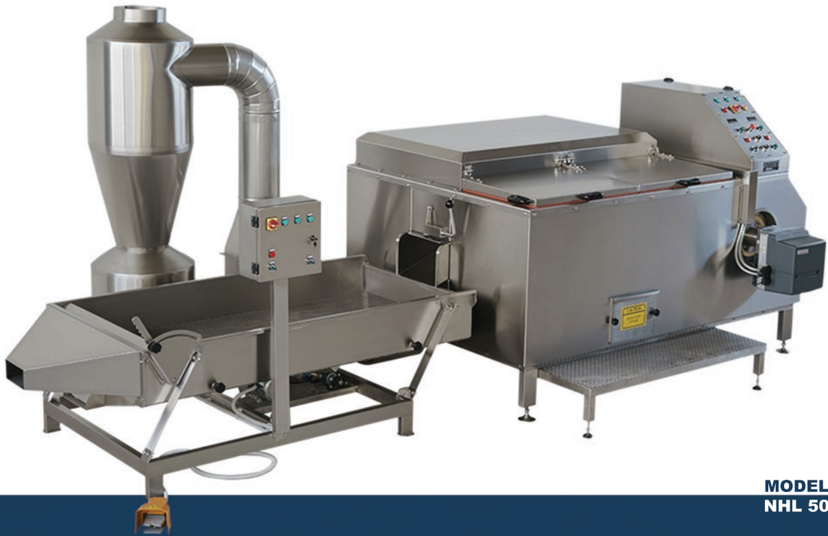
MODEL NHL 50

Ideal for roasting all kind of nuts, including sunflower seeds and pumpkin seeds.