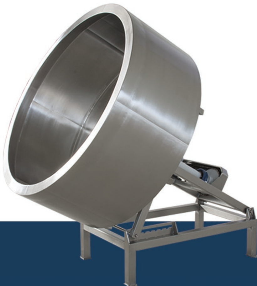
MODEL NOT 87

Every mixer is designed according to the desired application, the requested capacity and the type of the product.